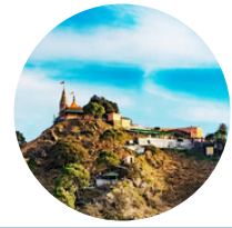
MANKI POINT (MONKEY POINT)